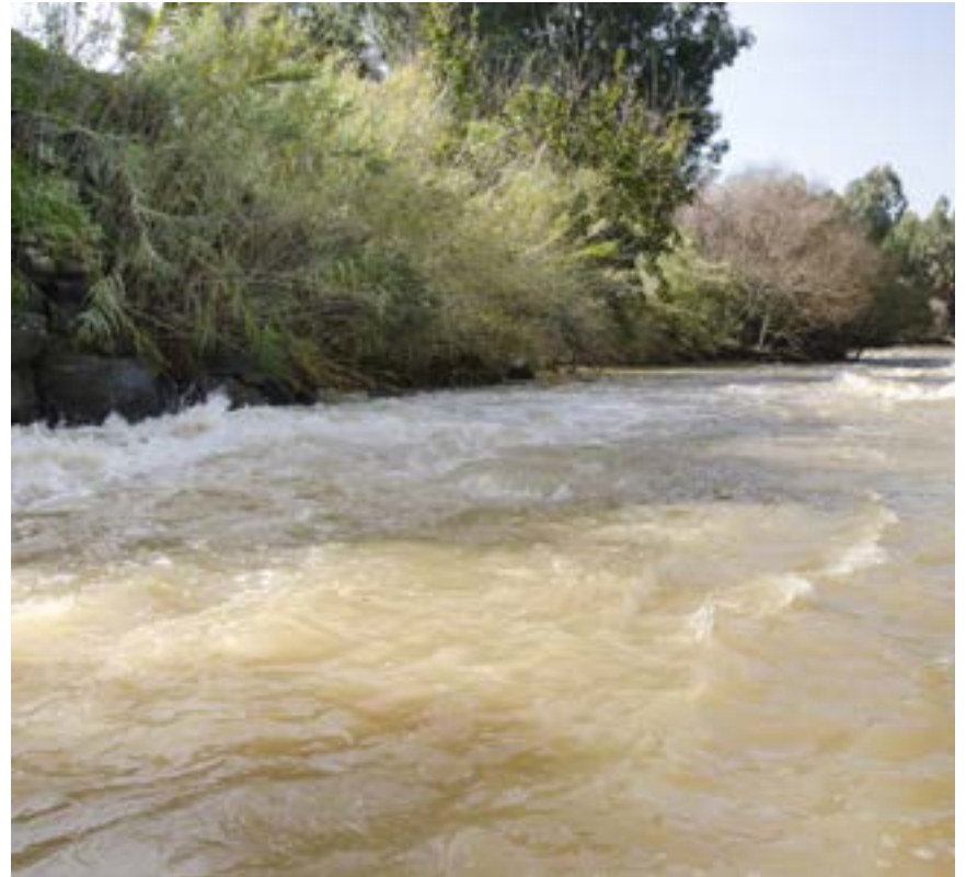
Jordan River, Israel.

The agreement shall provide for cooperation in managing existing sources of water and searching for new supplies, including development of existing and new water resources, increasing water availability through regional cooperation as appropriate and minimizing waste. The parties also will agree to cooperate to prevent contamination of water resources and to work together to alleviate water shortages. An international fund will be established to assist with desalination and other water-supply development and delivery infrastructure to satisfy the needs of Israel, Palestine and other riparian states of the Jordan River system.