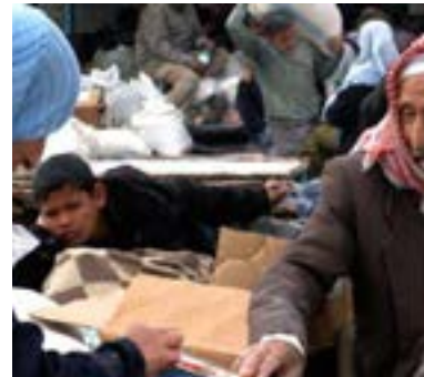
Palestine refugees, Gaza Strip.

12 The Palestinians' traditional position insists on the "right of return" of refugees to their original homes in Palestine according to their interpretation of Resolution 194. Israel and the United States do not recognize such a "right of return." U.N. General Assembly resolution 194 of Dec. 11, 1948, states in paragraph 11: "Resolves that the refugees wishing to return to their homes and live at peace with their neighbors should be permitted to do so at the earliest practicable date, and that compensation should be paid for the property of those choosing not to return and for loss of or damage to property which, under principles of international law or in equity, should be made good by the Governments or authorities responsible."