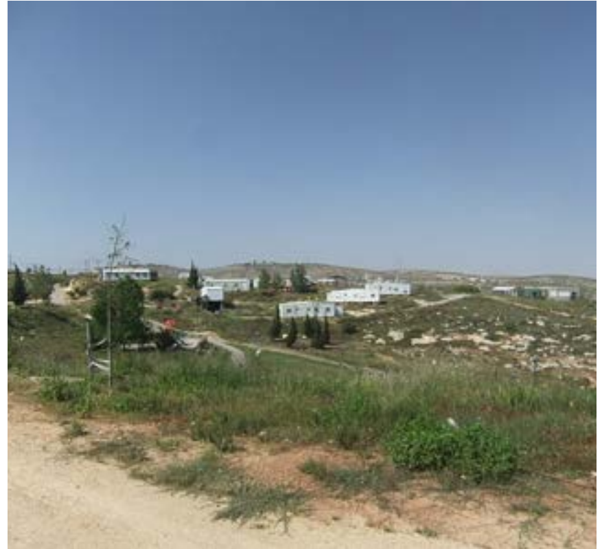
Amona, Israeli outpost in the central West Bank.

In accordance with the laws of the State of Palestine, individual Israeli citizens may apply for residency and/or citizenship in the State of Palestine. The parties will reach agreement on the disposition of all fixed assets and infrastructure within Israeli settlements, with the goal of transferring such assets and infrastructure in good condition to the State of Palestine in return for fair and reasonable compensation.