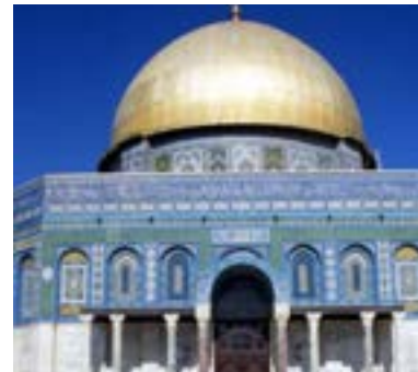
The Dome of the Rock, Jerusalem.

14 In addition to an agreement between Israel and the PLO, Jordan also will have a role to play in deciding the future of the city, according to the Jordan-Israel Peace Treaty and agreements reached between Jordan and the PLO.