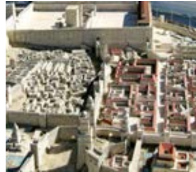
Ancient Jerusalem in the period of the second temple.