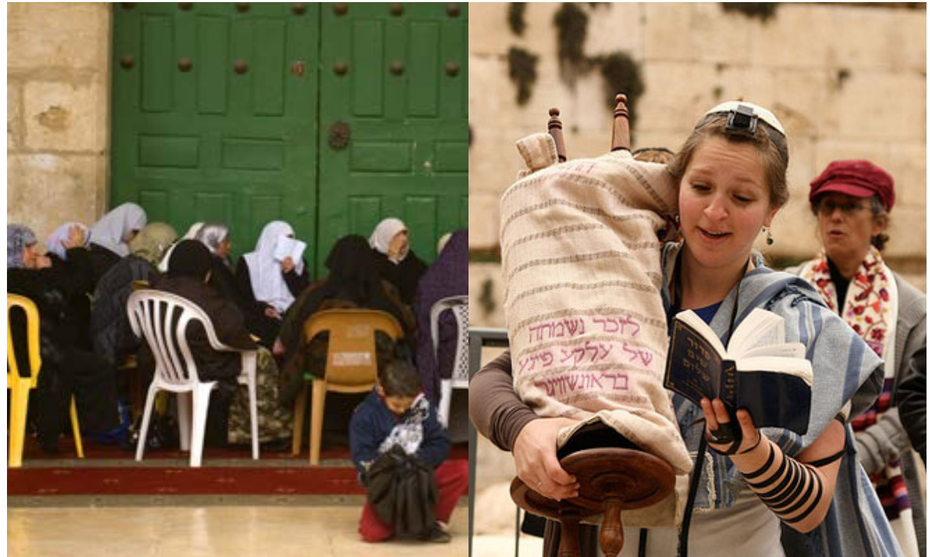
Left: Women at Al Aksa Mosque, Jerusalem, Israel. Right: Women of the Wall have been pushing to wear prayer shawls and read from the Torah at the Western Wall in Jerusalem.

The parties will agree on a list of such places in the two states. The two states will agree to protect and respect all sites of religious, historic and cultural significance. Each state will ensure adequate protection for freedom of access and worship. International monitors will oversee implementation of these provisions to all the sites so listed.