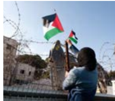
Palestine refugee, East Jerusalem.

An international fund will be established to help defray the cost of compensation and resettlement of Palestinian refugees and Jewish refugees from Arab countries. 13