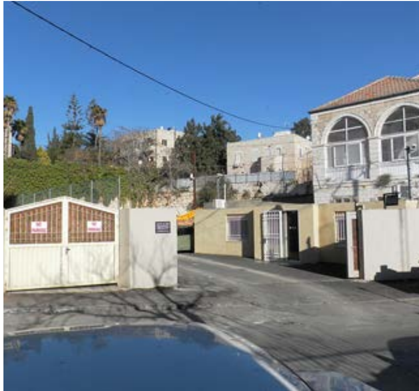
Offices of the Quartet in Jerusalem.

The parties, with the assistance of the Quartet 16 and other international organizations as appropriate, will establish an international mechanism to monitor and facilitate implementation of the agreement, and assure full compliance with all its terms.