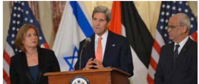
Israeli Justice Minister Tzipi Livni, U.S. Secretary of State John Kerry and Palestinian Chief Negotiator Saeb Erekat address reporters on the Middle East Peace Process Talks at the U.S. Department of State in Washington, D.C., on July 30, 2013.

The agreement will stipulate that the two states will not join or assist any alliance that requires either state to launch aggression or other acts of military hostility against the other.