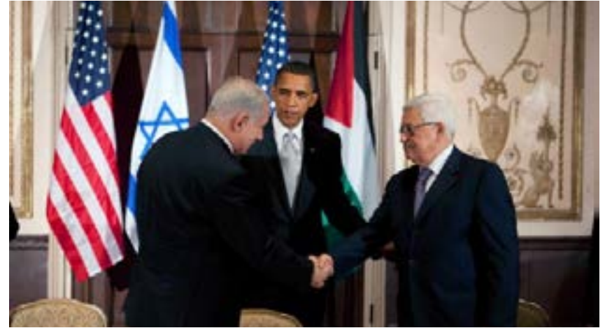
Prime Minister Benjamin Netanyahu, President Barack Obama and President Mahmoud Abbas shake hands before a trilateral at the Waldorf Astoria Hotel in New York, N.Y., on Sept. 22, 2009.

Israel will recognize Palestine as the national home of the Palestinian people and all its citizens, and Palestine will recognize Israel as the national home of the Jewish people and all its citizens. Each state will affirm the importance of maintaining and strengthening peace based on freedom, equality, justice and respect for human rights and dignity. Each state will work to eliminate incitement against the other state, as well as efforts to delegitimize the other state. The parties will agree to the full and orderly implementation of the terms of the agreement, in accordance with agreed means, methods, sequencing, timelines and provisions.