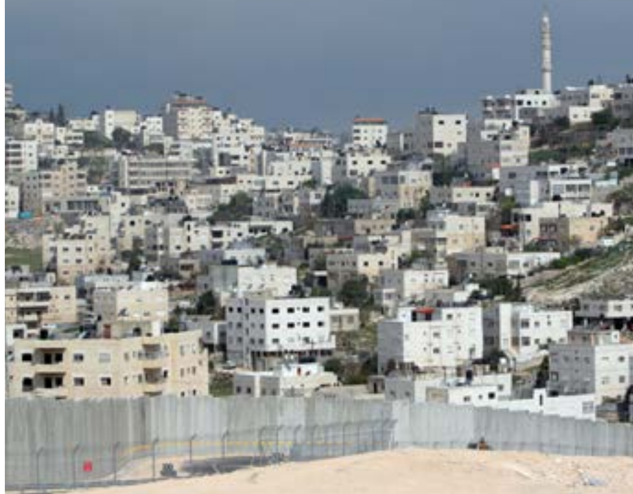
The new security wall dividing Israel from Palestine.

5 The outcome of negotiations will be a secure, recognized and defensible border 6 that ensures the territorial integrity, contiguity and viability of both states. 7